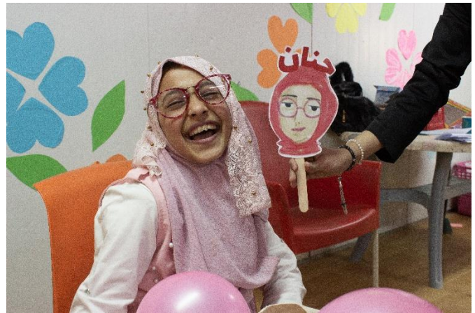
A tween imitating one of Jazirat Al Zohoor characters

This journey has been transformative - not only for the girls, but for those of us who work with them every day. This process of putting them in the lead forced us to question our egos and intentions all the time. The journey has been painful, happy, messy, confusing, stressful and more! In a word, it is very human, which is exactly what our efforts need.