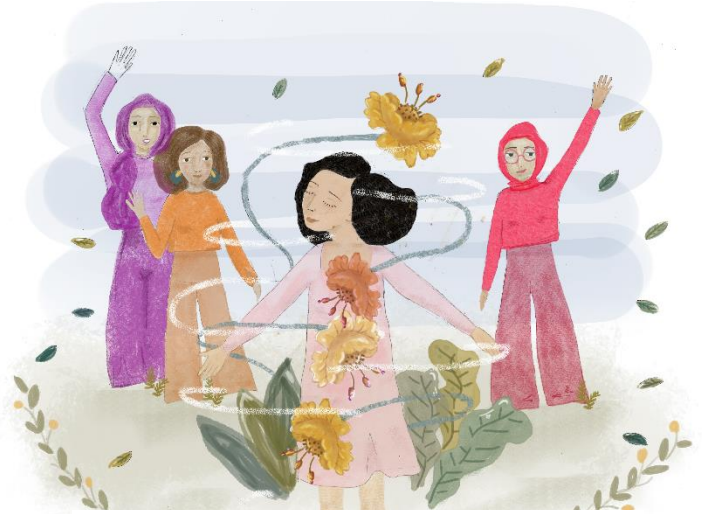
A sneak peek into Jazirat Al Zohoor story

This is a story about a story. The story of how nine adolescent girls in Jordan’s Za’atari Camp designed Jazirat Al Zohoor (The Island of Flowers), a storybook that helps tween girls learn about puberty in a fun way. Together, the group of nine worked through the phases of human-centered design (HCD) to develop the story and use it to lead sexual and reproductive health and rights (SRHR) education sessions for young adolescents. At the same time, each girl went through her own journey to discover accurate information about her own body, become comfortable talking about puberty, and find creative ways to reach tween girls with accurate and engaging reproductive health information. Over the course of a year, the girls built ownership and agency that extended beyond the program, built important life skills, and empowered a network of 127 tween girls to navigate puberty in Za’atari Camp.