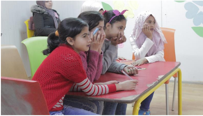
A group of tweens attending Jazirat Al Zohoor session

› “I told my classmates that I attended this session, and I showed them the puberty kit”